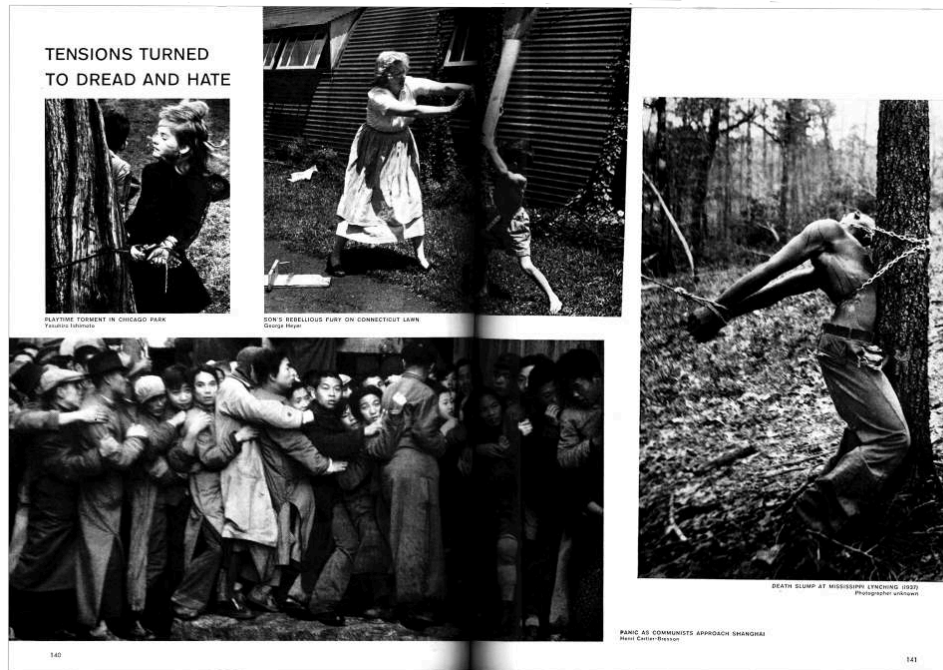
Figure 4: Life Magazine , 14 February 1955. Henri Cartier-Bresson, "China," ©Magnum Photos; Yasuhiro Ishimoto, "Little Ones," ©Kochi Prefecture, Ishimoto Yasuhiro Photo Center; reproduced with permission.