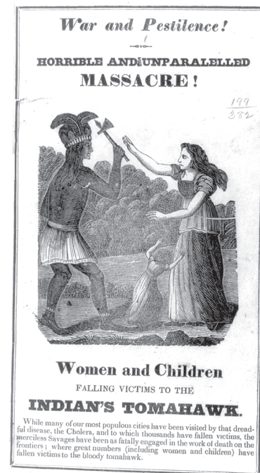
“War and Pestilence! Horrible and Unparalleled Massacre! Women and Children Falling Victims to the Indian’s Tomahawk.” ca. 1800