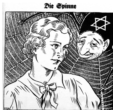
“Die Spinne,” WWII-era cartoon by Philipp “Fips” Rupprecht for Nazi publication Der Stürmer .

Espiritu highlights, early 20th century popular culture depicted dark-skinned caricatures of Japanese men attacking or abducting White women. The ideologies reflected in these images helped pave the way for the mass internment of Japanese American men, women, and children during the Second World War. U.S. war bonds evoked fears of the “yellow peril,” with messages such as, “Keep This Horror From Your Home.”