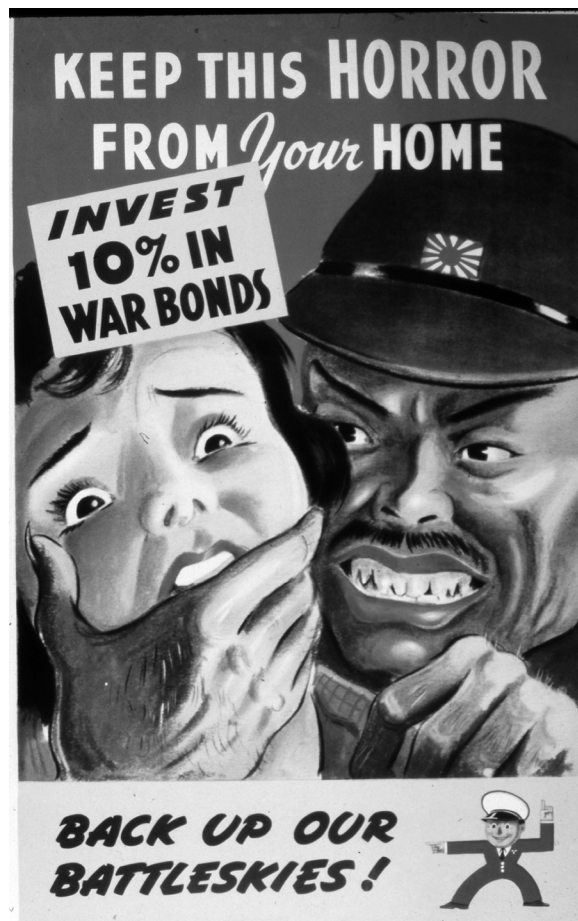
U.S. Office for Emergency Management, U.S. War Production Board, 1942-1943.

As evidenced by Donald Trump’s 2016 election, danger narratives continue to function as a powerfully effective political strategy for mobilizing a White, Christian constituency fearful of racial, ethnic, and religious others. Long before he ran for office, Trump leveraged his race, class, and gender privilege to take out a full-page ad in the New York Times , in which he demanded the death penalty for the “Central Park Five”—a group of young men of color falsely convicted and wrongly imprisoned for allegedly raping a young White woman in 1989. When the men were exonerated by DNA evidence 13 years later, Trump defiantly clung to his