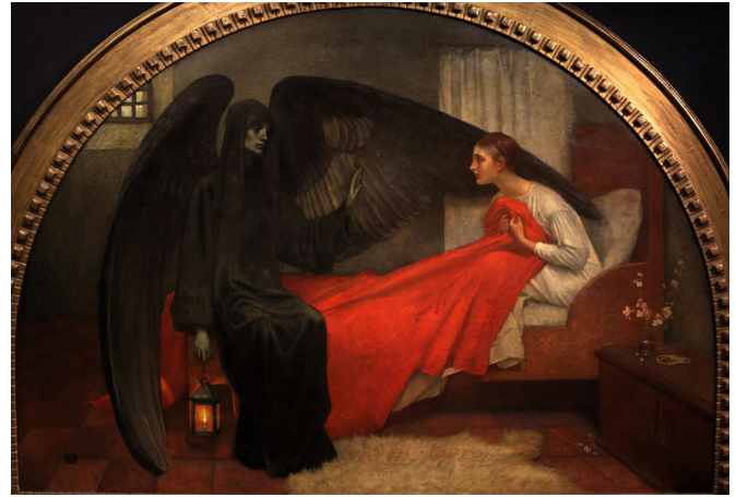
Figure 2 La jeune fille et la mort , Marianne Stokes, 1908, Musée d'Orsay, Paris. https://commons.wikimedia.org/wiki/File:La_Jeune_Fille_et_la_Mort-Marianne_Stokes-IMG_8224.JPG

Perhaps it is fanciful, but when I listen to this music, I cannot help but hear the struggle of an individual facing news that death is coming. The quiet, spare plangent notes of the G minor theme, seem awfully reminiscent of the silence that follows the breaking of terrible news. We then hear a series of variations that convey an increasingly frenzied and frenetic struggle against inevitable mortality.