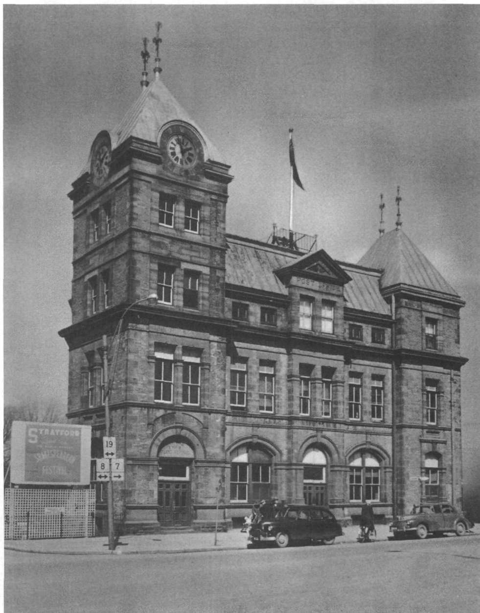
Figure 1. Post office, customs, and inland revenue building, Stratford, Ontario, begun 1881, demolished 1961. Photograph from the 1950s.

was designed, if not by Scott, at least under him; but in all events, not by Fuller, as I had believed. 3