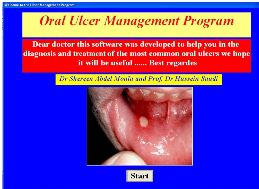
Fig. 1. The software layout showing the starting page.

prevalence of some of such ulcers such as histoplasmosis ulcer, oral chancre, ulcers of syphilis and gonorrhea, tuberculosis ulcers and ulcers of neutropenia. In addition to some difficulties in diagnosis due to presence of other systemic signs and symptoms that may confuse the postgraduate student or the data