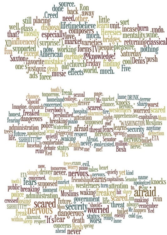
Fig. 3: Top fear words for WDF (top), sLDA (middle) and UMM (bottom) lexicons