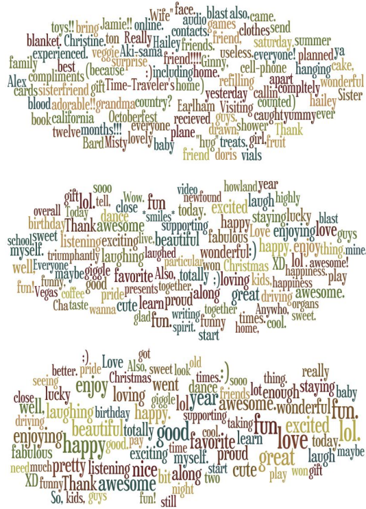
Fig. 4: Top joy words for WDF (top), sLDA (middle) and UMM (bottom) lexicons

sLDA based lexicons performed better over the WDF ones given that it was better able to model word-emotion associations from the documents as illustrated in section 6.5.