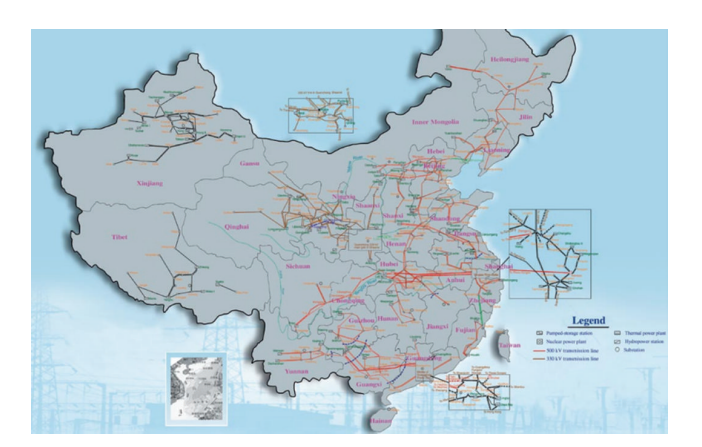
FIGURE 2: Map of Chinese power grid, adopted from [16].

There are fears that solar power may fail to support economic developments the way coal or crude oil power has