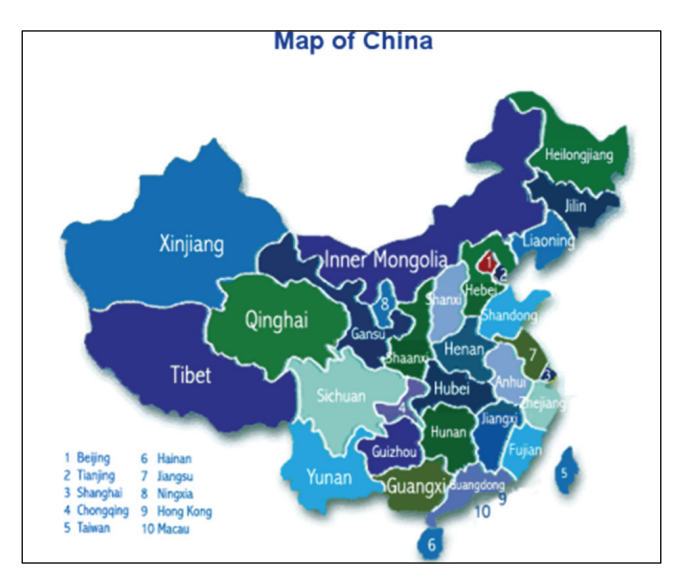
FIGURE 1: Provincial map of China showing the location of Jiangsu province, adopted from [10].

Even though there is a large deposit of studies which interrogates both practical and scientific optimization ideas, it is still to be determined a straightforward and easy-to-use approach to standardized energy forecasting especially when it comes to solar energy. If the results of different experimental projects are compared, this makes it more difficult to arrive at a simplified and standardized energy forecasting approach because most of these studies analyzed cases that are region specific. Further, there is no constant form of result evaluation across all publications, as different error metrics are applied to measure output quality [8]. Our task in this research is to propose measures towards addressing optimal solar energy forecasting by employing a systematic optimization approach based on a hybrid of weather and energy forecast models. After giving an overview of the sustainable energy issues in China, we have reviewed and classified the various models that existing studies have used to predict the influences of the weather influences and the output of solar energy production units. Further, we describe the process of solar energy forecasting and establish the relevant parameters, settings, and other exogenous influences for selecting the appropriate model against that background. Next, we evaluate the performance of an exemplary ensemble model which combines the forecast output of two popular statistical prediction methods using a dynamic weighting factor [9].