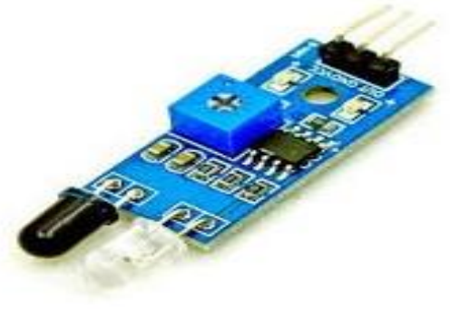
Fig -5: IR Sensor

IR sensors used as input circuit. One IR sensor pair is fitted on in door and one is fitted on our door. These IR sensor will check the persons coming in and out of the hall. These are connected to the microcontroller. Controller counts the in person and the out persons.