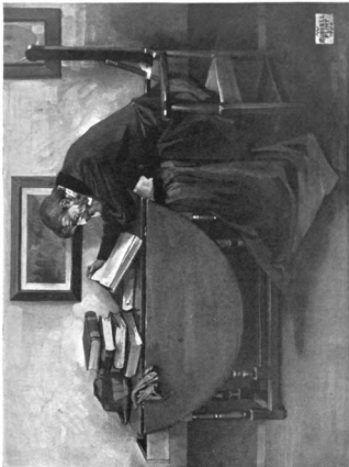
"CARLYLE, HIS MIND STARVING FOR WANT OF FOOD, DEVOURED THEM AT THE RATE OF ONE A DAY."