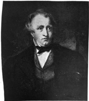
THOMAS BABINGTON, BARON MACAULAY.

From the Painting by Sir Francis Grant, P.R.A.