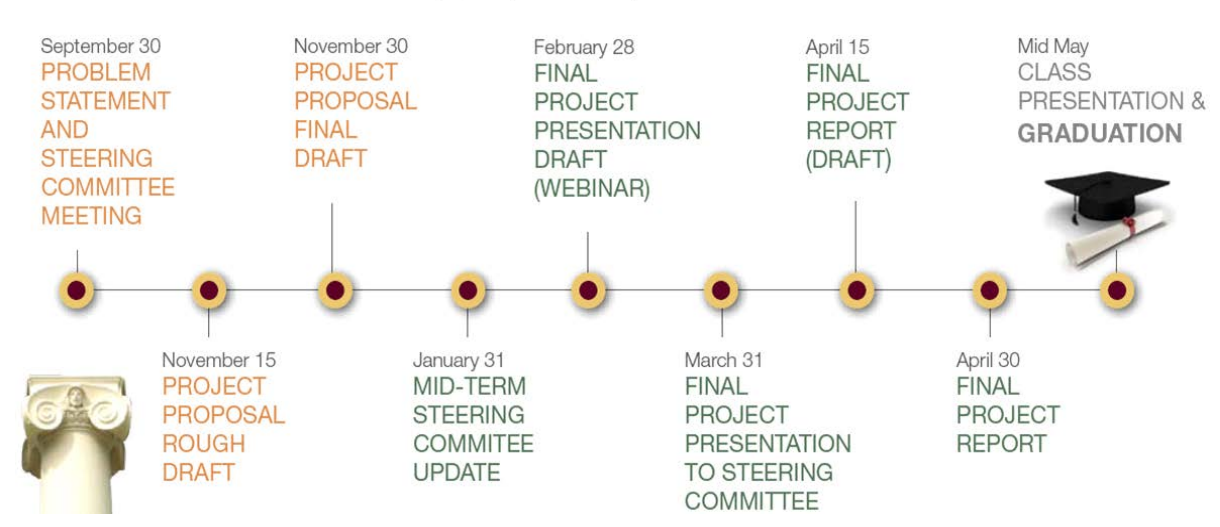
Figure 2. Capstone Project Timeline and Deliverables