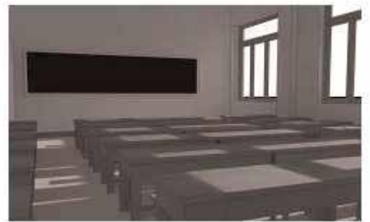
Figure 3. One classroom model of the WMUVC system

The models in WMUVC include: buildings such as classroom, library and laboratories, vegetal structures like trees, flowers and bushes, and avatars which is the presentation of students and teachers and other people who involve this system. Every mockup is linked to department homepages, laboratories and educational tools including literature, videos and listening materials referring to the courses. The modeling could not be performed from CAD models due their complexity and elevated number of points to describe each structure. But the CAD models generated by 3DSMAX were used to identify proportions and localization of the structures in the virtual environment. The models shown Fig.3 is one classroom in the WMUVC system.