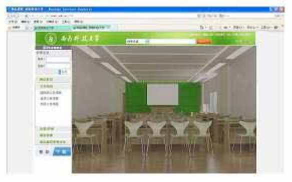
Figure 4. The interface of WMUVC

can access the information and other education materials, and, furthermore, some words expressed materials, videos and listening materials could accessed by WiFi through smart phone or other devices. Fig. 4 is the interface of the system, users can load on the system with their identities validation to get start the courses. For the non-member people, they could skip the common information.