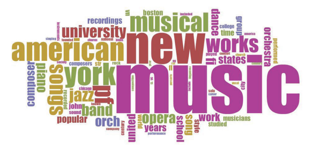
Figure 3. Word cloud: most frequent terms in Amerigrove II . Generated by Voyant Tools.

which we were able to analyze—not only for a word's frequency (i.e., its number of occurrences) relative to that of other words within each edition but also for how a word's frequency differed between the editions.