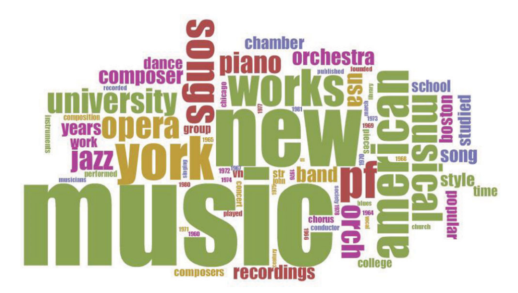
Figure 2. Word cloud: most frequent terms in Amerigrove I. Generated by Voyant Tools.