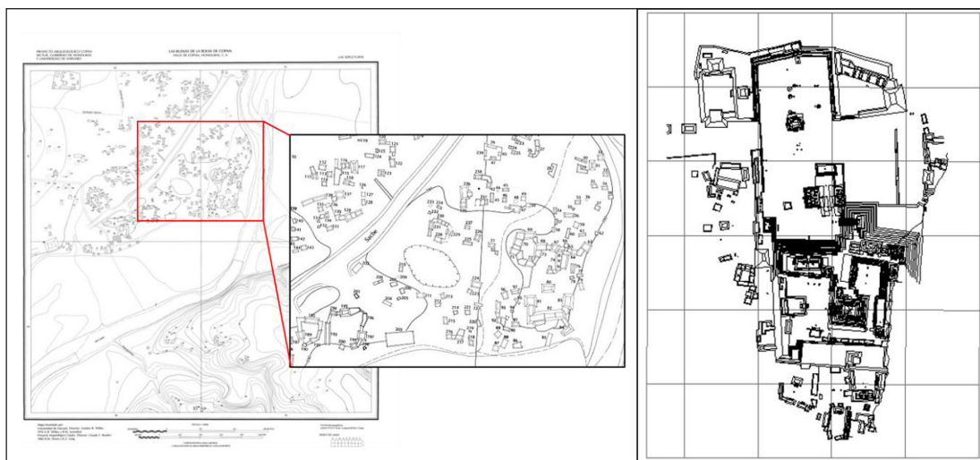
Figure 1: Example of 1:2000 scale plane table and alidade map, from Fash and Long (1983) (left) and photogrammetric map at scale 1:200, from Hohmann and Vogrin (1982) (right).

In the case study, maps ranged from twenty-four 1 km square plane table and alidade maps at a scale of 1:2000 ( Figure 1 ) (Fash and Long 1983) to 1:200 scale photogrammetric maps of Copán's civic-ceremonial core (Hohmann and Hohmann-Vogrin 1982), to excavation maps of individual sites (Maca 2002; Webster 1989). After researching how each of the existing maps were created, we decided to georeference them to the Copán Archaeological Project (PAC 1) site grid (Fash and Long 1983) for several reasons. First, it offered the best tie points for Copán's heterogeneous mapped data. It also provided a way to double-check and link attribution because structure and group names are based on grid quadrants with additional data (e.g. site type, number of plazas) available in a separate volume (Fash and Long 1983). Third, the Copán site archives contains a massive collection of original field notes, type-written versions of the field notes, original hand-drawn maps, reports to funding agencies, and final publication drafts. Such sources were helpful in determining how much to rely on particular internal details. For example, when an archaeologist's field notes indicated that an area was heavily forested, we noted that archaeological structures and contour lines may be less accurate here than in other areas.