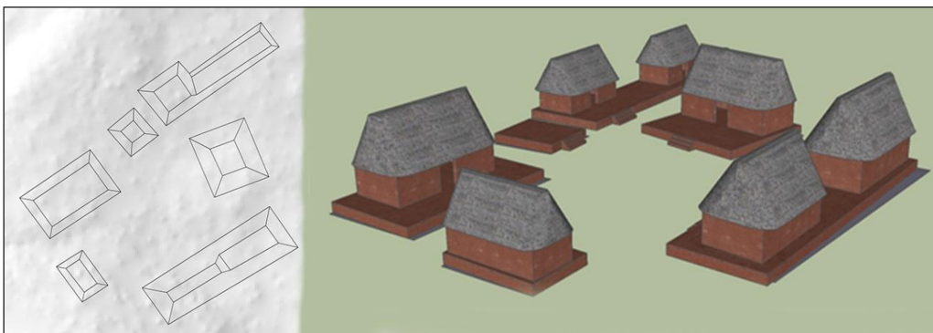
Figure 4: GIS Map of Group 12M-1 from San Lucas neighborhood, Copán (left); 3D SketchUp reconstruction of Group 12M-1 (right).

Our particular experience working with geospatial data at an archaeological site with over 100 years of excavation history necessitated translating various analog data into digital data. Because we are dealing with raw and derived geospatial data, the steps of the digitization and datafication process are complex; therefore, we aimed to provide some perspective to help guide others in an area for which standards and best practices are emerging. The historical approach we advocate (following Wood 1990) provides a methodology for assessing the origins and accuracy of static analog and born-digital data. In converting different