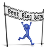
Figure 4. Best blog quote.

at the bedside. Poon, Greenwood-Ericksen, and other residents participating in the discussion online described the educational influence of the heterogeneity in attending physician practice and lack of specific guidelines. Resident trainees are often left uncertain and confused about the appropriate place for opioids in their clinical practice and how to use and judiciously prescribe without contributing to the problem of opioid use disorders: