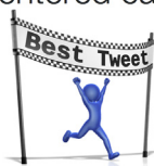
Figure 6. Twitter commentary.

“@M_Lin: increase opioid use for headaches ncbi.nlm.nih.gov/pubmed/25091873 #ALiEMRP” suggests poor pt centered care at expense of pt satisfaction