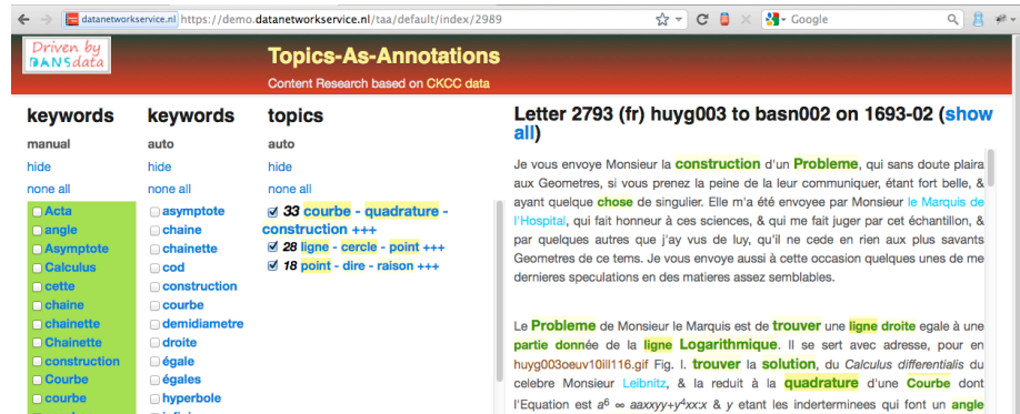
Figure 2. Screenshot of Topics/Keywords as Annotations

Although the implementation, EMDROS (Petersen, 2004) 14 is open source, well documented, and a powerful solution for text databases, it is definitely not a mainstream application, and its life span is hard to guess.