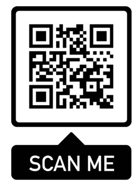
FIGURE 1. Please access The Kingdom of Copper StoryMap through this link: http://bit.ly/Faynan. The StoryMap is also accessible by scanning this QR code with a smartphone.

In order to generate the StoryMap, team members developed an iterative planning process to ensure that the StoryMap would meet its goals of digital public outreach in an interactive mapping environment (Figure 2). This process can serve as one model for how to conceptualize and develop an interactive public outreach project using digital data in ArcGIS StoryMaps (Alemy et al. [2017] provides an excellent overview of the technical process of creating a StoryMap). In general, our strategy was to make sure that narrative and engaging users in the archaeological process drove the framing of the StoryMap, rather than designing the product based on the availability of datasets. To that end, our first stage in generating the StoryMap was to create a storyboard conceptualizing the story elements important to framing the archaeology of Faynan, Jordan, in its appropriate context. Next, it was important to write the text to be laid out in the StoryMap, telling a story based on archaeological information rather than the suitability of existing maps, images, or 3D models for accompanying the story elements. Writing a compelling story based on archaeological information is challenging, and researchers may benefit from collaboration with experienced storytellers. Analyzing and developing media to complement the text is also necessary, though this should be taken up after storyboarding and writing the StoryMap narrative.