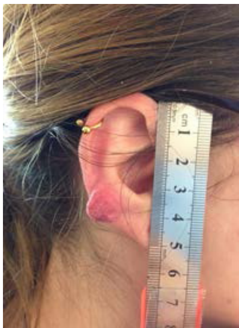
Figure 2 Follow-up after 1 month of wearing the pressure earring.

At 1 month follow-up, during which time she had been wearing the pressure earring consistently, a slight improvement was observed with a mild reduction in the overall size of the keloid scar. Another injection of 40 mg methylprednisolone acetate was given locally (Figure 2).