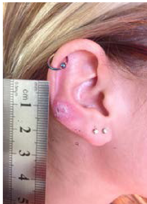
Figure 3 Keloid scar 5 months since the initial presentation with a flattened appearance.

A further 2 months on, the base of the keloid remained unchanged at 10 mm; however, the total thickness of the helix reduced to 7 mm. The posterior region of the helix remained a small flat patch, while the anterior of the helix presented with only minimal keloid content. At this time, another injection of 40 mg methylprednisolone acetate was administered. After completing a year's treatment with methylprednisolone