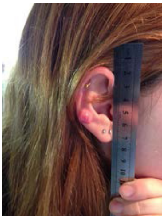
Figure 1 Keloid scar at first presentation.

At 1 month follow-up, during which time she had been wearing the pressure earring consistently, a slight improvement was observed with a mild reduction in the overall size of the keloid scar. Another injection of 40 mg methylprednisolone acetate was given locally (Figure 2).