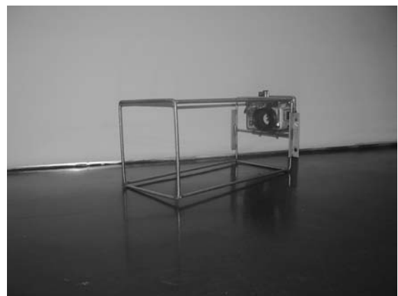
Fig. 2 Waterproof casing attached to stainless steel structure

In situ and image based quantification frequency matrices were converted into percentage cover matrices by dividing frequency of occurrence of