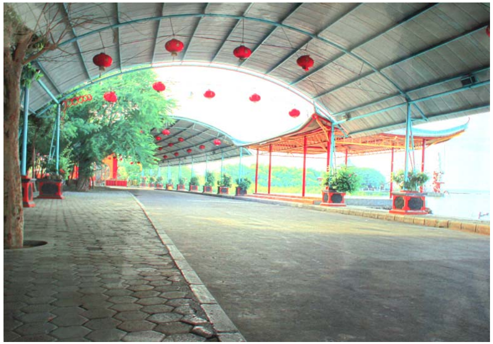
Figure 6. A HDR photograph by student Heru Wibowo

hyperrealism. This is truly an experiment that has been impossible to capture using traditional photographic methods. Techniques of compositing HDR pictures on the photo shoot with the DSLR camera and in the computer have to be explained in detail prior to and after the exercise.