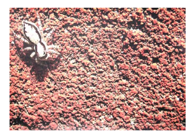
Figure 1. "Crawling Spider" by student Kevin Winaldy

This photo exercise challenges the students to not only start taking lots of pictures, but also be alert and aware with their eyes as to what they see around them. The setting of 100 pictures is to set a standard of productivity, not specifically a standard of quality yet. It sets a standard of how often each student should be taking pictures and at the same time taking advantage of the digital camera's capability of capturing lots of images. From there, students are supposed to pick only the best 10 pictures of 100 to be presented in front of the class. The discussion topic would include not only about color and its language or expression or mood, but also composition and other design elements. This exercise could be applied to other design elements as well, for example, to take pictures of patterns and textures, lines, forms, and shapes.