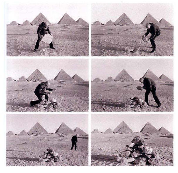
Figure 5. Duane Michals, I Build a Pyramid, 1978 (Ingledew, 2005)

A fifth exercise is to utilize the camera to create a sequence that creates humor. It may be a short sequence by using the continuous shooting ability of the digital SLR, or an expanded period of time. The purpose of this exercise is to let the students experience the making of a story through a sequence. To make them understand that sometimes we cannot interpret a story just from one picture but a series of pictures, such as the case in documentary photography for example. This helps them understand the significance of a theme and narrative in photographs. With humor played in, it introduces a fun and creative atmosphere into the process. Students may have the humor in each picture or at the end of the sequence as a punch line.