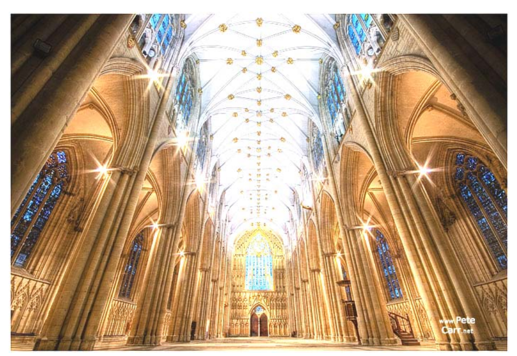
Figure 7. Example of a HDR photo by Pete Carr (http://www.petecarr.net, via http://www.vanilladays.com/hdr-guide/)