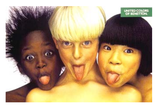
Figure 4. Oliviero Toscani's photo for an ad campaign (http://www.olivierotoscanistudio.com/)

A fifth exercise is to utilize the camera to create a sequence that creates humor. It may be a short sequence by using the continuous shooting ability of the digital SLR, or an expanded period of time. The purpose of this exercise is to let the students experience the making of a story through a sequence. To make them understand that sometimes we cannot interpret a story just from one picture but a series of pictures, such as the case in documentary photography for example. This helps them understand the significance of a theme and narrative in photographs. With humor played in, it introduces a fun and creative atmosphere into the process. Students may have the humor in each picture or at the end of the sequence as a punch line.