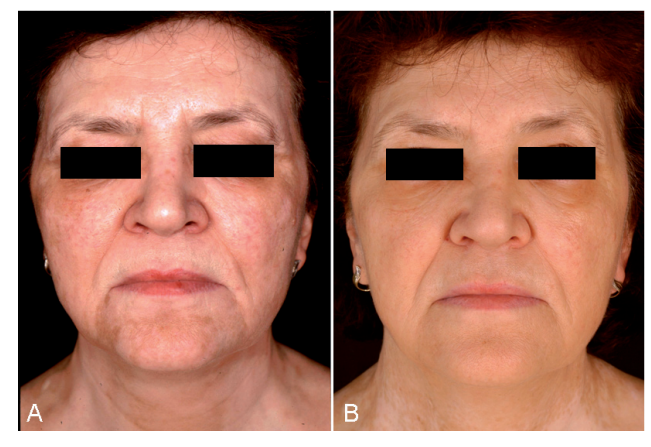
Fig. 1. A 61-year-old woman with progressive vitiligo since 14 years. (A) Before therapy. (B) After 9 months of treatment with 0.1% tacrolimus ointment.

In 16 of 17 patients (94%) who used additional occlusive dressings on the arms, repigmentation could be observed. Whereas no occlusion, or the use of household polyethylene foil, had no or a weak effect, polyure-thane foil and hydrocolloid dressing led to moderate to excellent repigmentation, respectively (Table II, Fig. 2). These results could be confirmed by colorimetric measurement, showing a significant increase in melanin index when polyurethane foil and hydrocolloid