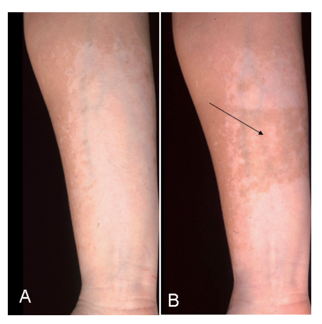
Fig. 2. A 43-year-old woman with progressive vitiligo since 22 years. (A) Before therapy. (B) After 9 months of treatment with 0.1% tacrolimus ointment applied on the entire right arm, combined with hydrocolloid dressing (arrow).

dressing were used (data not shown). Repigmentation started significantly earlier in the hydrocolloid group (11.3 \pm 3.4 \text{ weeks}) compared with the polyurethane group (29.3 \pm 4.6 weeks, p<0.0001). However, good therapeutic results could also be achieved in the polyurethane foil group despite later onset of repigmentation (Fig. 3). It was notable that patients with long disease duration showed significantly better results than those with a shorter history. Patients with a disease duration of more than 10 years had an overall mean repigmentation of lesions of the face and arms of 49.7\% \pm 37.9 , compared with 14.7\% \pm 27.3 in patients with a disease duration of less than 10 years (p=0.0009). Overall disease activity, as assessed by the VIDA score, was significantly decreased at the end of the study (p < 0.0001) (Table I). On the placebo-treated sites, 3 patients showed initial