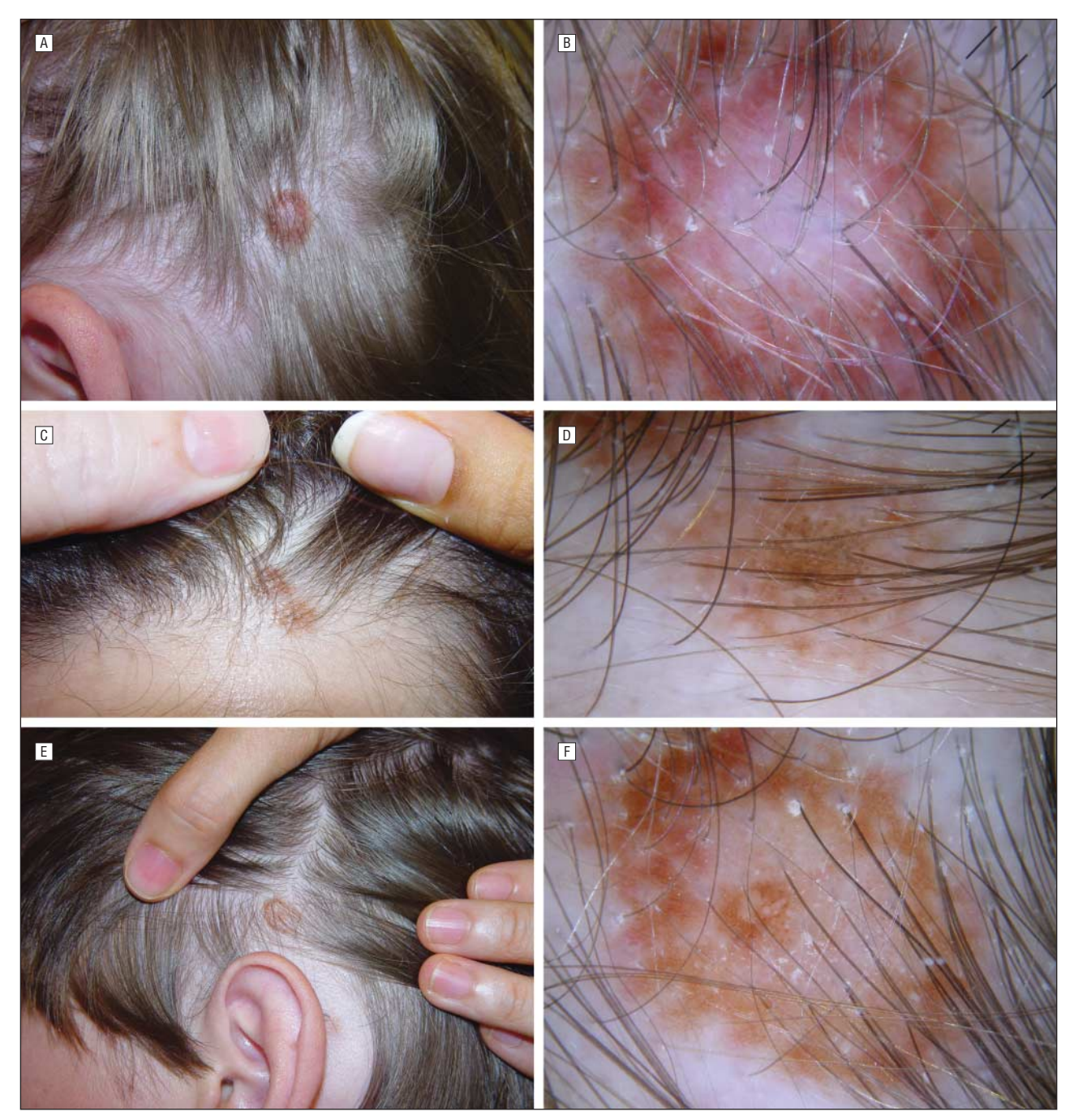
Figure 2. Examples of pattern morphologic features of scalp nevi. Shown are overview pictures (A, C, and E) from a digital camera and close-up photographs (B, D, and F) from a dermoscopic camera (original magnification \times 10). The images demonstrate eclipse (A and B), reverse eclipse (C and D), and cockade (E and F) morphologic features.

lar center, 32% [n=11]; and multiple factors, 32% [n=11]). Of those with noticeable changes, 18 (53%) became more atypical and 16 (47%) became less atypical. Most scalp nevi that became more atypical were because of increased diameter (7 of 18 [39%]) and more color variegation (6 of 18 [33%]). Six percent of the scalp nevi (1 of 18) had more than 1 feature that became more atypical. Although clinical features in 53% of the nevi became more atypical, none of the changes were considered to be concerning for melanoma or to require excision. The most common features to change in those nevi to become less atypical were color variegation, asymme-