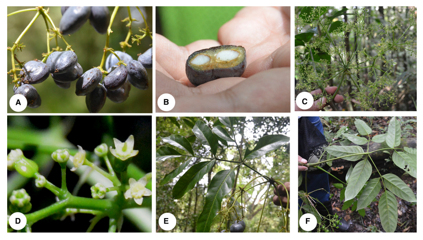
Fig. 2. Photographic set of Mackinlaya celebica (Harms) Philipson (Apiaceae), specimens Chua 016 and Chua 041 . (A) Fruit. (B) Dissected fruit. (C) Inflorescence. (D) Flower. (E) Upper side of leaf. (F) Lower surface of leaf.

still have reliable documentation for the presence of more than 70 species at a previously unexplored site. We would also have a wealth of new morphological data on phenology, ecology, and floral and fruit color. Even photographs that cannot be identified to species proved valuable. For example, the three species of Cyrtandra that were not identified were nonetheless of sufficient quality to allow a confident assertion that they are likely new species. This occurrence is not unusual. During a recent national review of the genus Dillenia L. (Dilleniaceae), we noted on the Internet a set of high-quality photographs of a species with yellow flowers from a poorly collected part of Luzon and readily determined this to be a species that could not be accommodated in the last regional revision of the genus (Hoogland, 1952). The exact location is known and efforts are now underway to make a formal collection and so provide the species with a name.