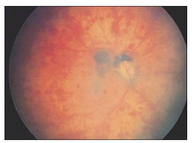
Figure 1. Image of the retina produced with a wide-field digital ophthalmic camera (RetCam 120; Massie Research Laboratories, Inc, Dublin, Calif), showing extensive intraretinal and preretinal hemorrhages throughout the periphery of the retina, with 1 large hemorrhage lateral to the optic nerve.