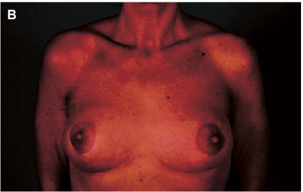
Figure 1 Breast augmentation surgery. The postoperative photograph has been manipulated to reduce scar prominence.

may have been digitally manipulated. To further safeguard surgeon objectivity, they were told before viewing these photographs that this series of 10 was one of a number of series of photographs they would be asked to review, within which manipulated images were randomly inserted, and they should therefore make no assumptions about the presence or absence of manipulated image in the particular series they were reviewing. The surgeons were simply asked to identify the manipulated photographs and state in which way they thought the images had been altered.