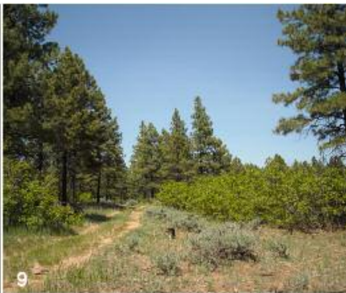
FIG. 9. Type locality habitat, San Juan Co., Utah.

Discussion. Based upon the male genitalia, Antaeotricha utahensis is closest to A. fuscorectangulata (adult forewings heavily maculated), but the tegumen is not produced into a dorsally projecting process in front; the aedeagus is shorter and broader with a different complement of cornuti. The female genitalia are closest to A. thomasi , but the signum in A. thomasi is a cross with a projecting element. In A. thomasi , the ductus seminalis originates from the midpoint of the ductus bursae, while it originates from the upper quadrant of the corpus bursae in A. utahensis .