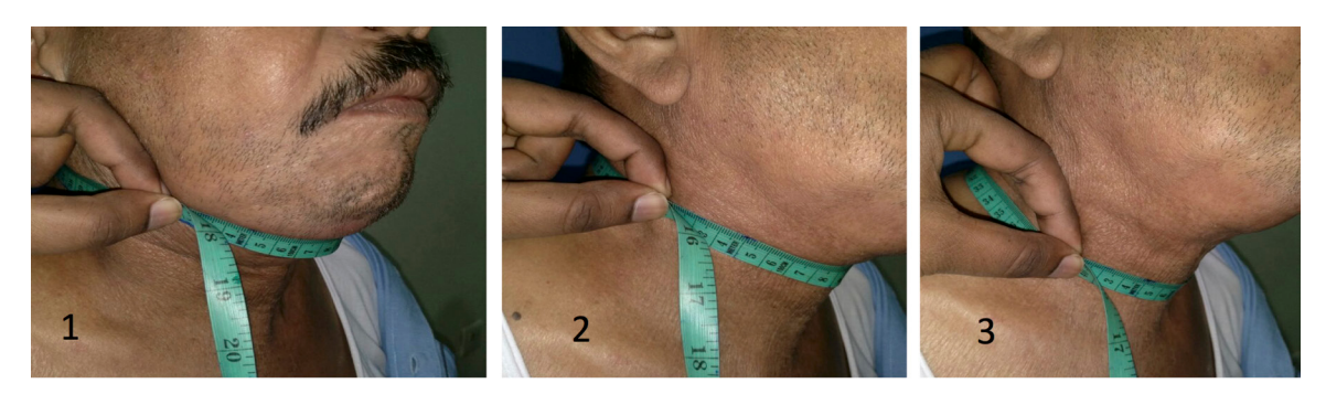
Fig. 2. Location of measurement points on the neck include: 1) Upper neck circumference taken at the highest point inferior to the mandible; 2) Length from ear to ear measured at the inferior junction of ear lobe and face on left to inferior junction of ear lobe and face on right intersecting a point 8 cm inferior to the lower lip edge; and 3) lower neck circumference taken at the lowest possible point superior to the angle of the neck and shoulder.

Permission granted for single print for individual use. Reproduction not permitted without permission of Journal LYMPHOLOGY.