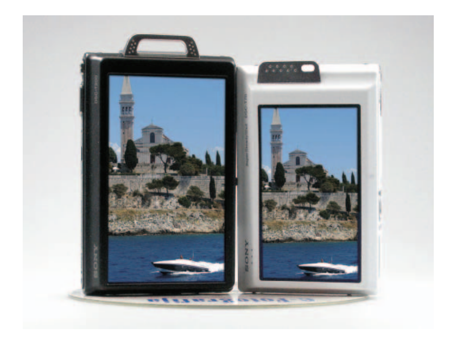
FIGURE 1 Camera screen image.

a bright picture on it. A similar development can be observed in the way in which the design of higher end camera phones and some PDAs almost eliminate the keypad, and therefore sacrifice some of the functionality, in order to maximize the screen.