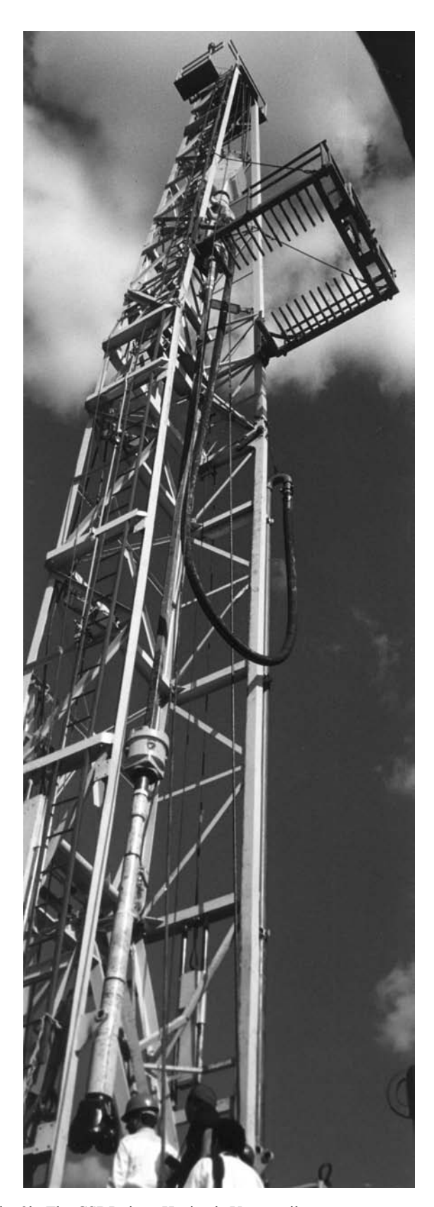
Fig. 2b. The CSDP rig at Hacienda Yaxcopoil.

has been proposed in Dressler et al. (2003) and in other papers included in these volumes (e.g., Tuchscherer et al. 2004; Stöffler et al. 2004). The Cretaceous sedimentary rocks below about 895 m are cut with dikes of polymict breccias and display zones of monomict brecciation. They appear to represent "megablocks" displaced by the impact event. Anhydrite layers, the thickness of which varies from a few centimeters to up to 15 m, and make some 27% of the megablocks. Organic-rich layers and oil-bearing units are present at depths between 1410 and 1455 m (according to Kenkmann et al. [2004], this layer starts at 1263 m.).