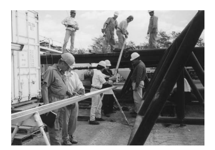
Fig. 2a. Drilling operations at Hacienda Yaxcopoil.

an automated digital core scanner were available for documentation. Cores were transported from the drill site daily, and information was made available on the CSDP web site through the ICDP information system. After completion of drilling operations, cores were packed and shipped to the UNAM Core Repository in Mexico City. Cores were further examined and then cut longitudinally in halves (one half is the project archive, while the other one is available for sampling