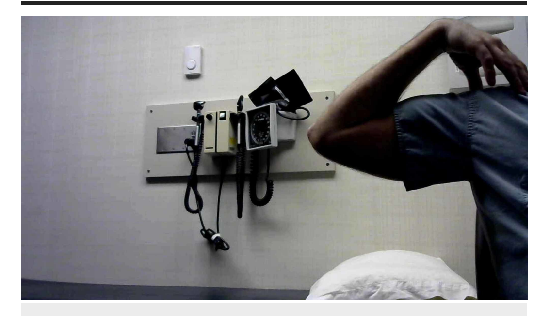
FIGURE 2: Maximum flexion

A participant demonstrates maximum extension during a clinical trial