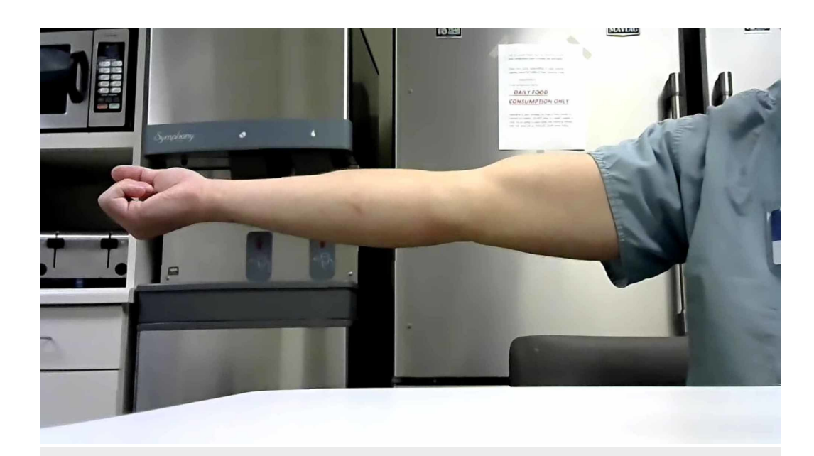
FIGURE 1: Maximum extension

A participant demonstrates maximum extension during a clinical trial