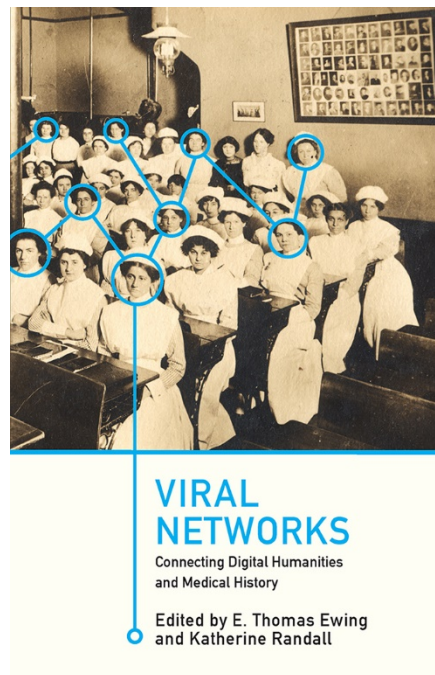
Figure 3 Cover of Viral Networks: Connecting Digital Humanities and Medical History