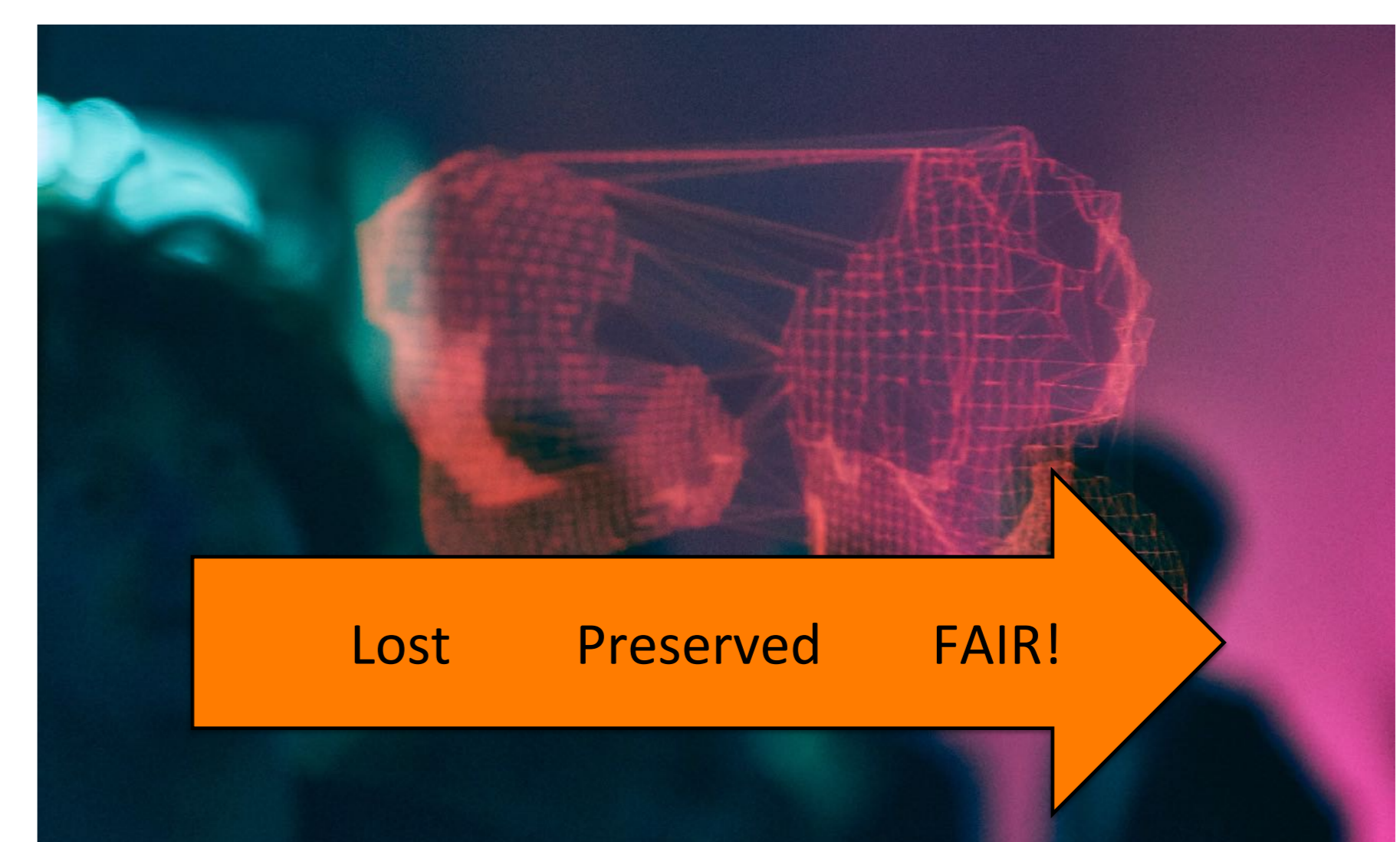
Vision for Humanities Data