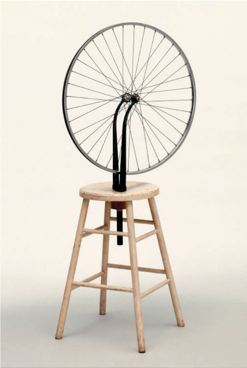
Fig. 2. (Colour online) Marcel Duchamp, Bicycle Wheel (1951, reconstruction of lost 1913 original). © Succession Marcel Duchamp/ADAGP, Paris/Artists Rights Society (ARS), New York, 2017.