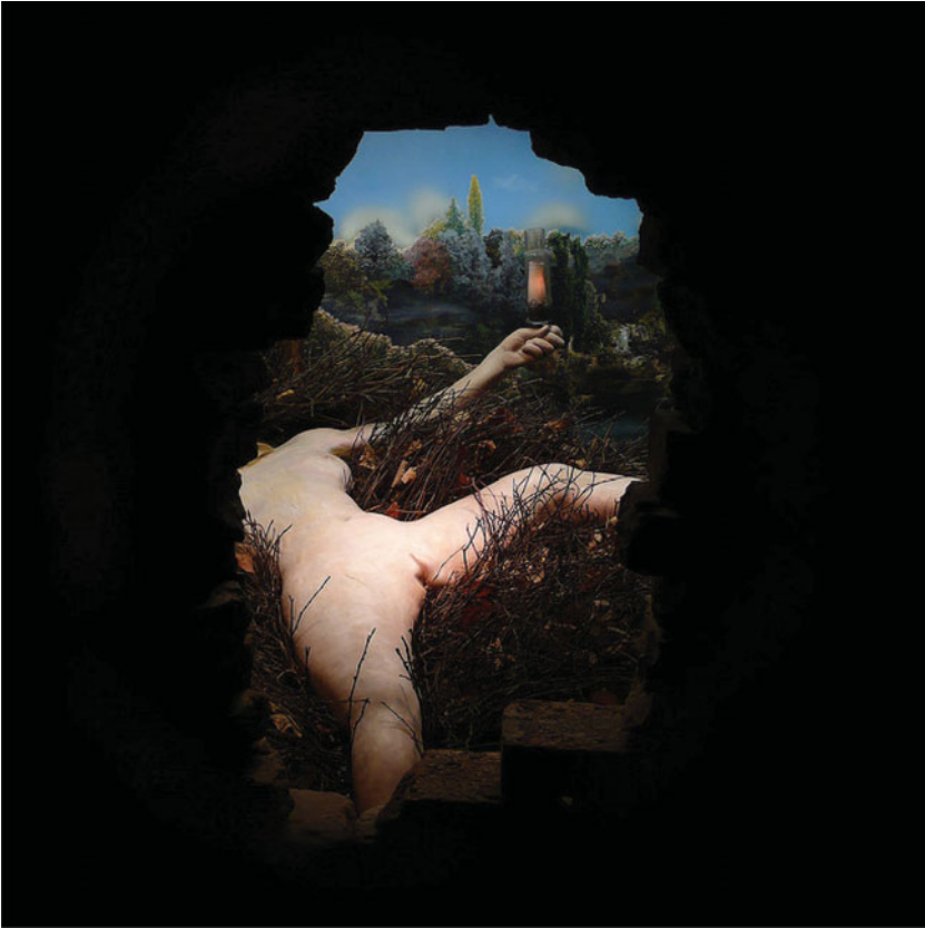
Fig. 4. (Colour online) Marcel Duchamp, Given 1. The Waterfall 2. The Illuminating Gas (1946–66).

of transcendence from ordinary life and the limitations of material existence, albeit an entirely private and personal one. In this sense, for all the extremity of his assault on the category of art, Duchamp may have in fact remained an artist.