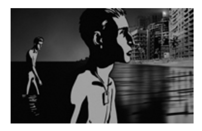
Figure 3 Still image from Waltz with Bashir (Ari Folman, 2008).

Emotional rather than visual realism is the stylistic choice for Folman and also for Chris Landreth in his Oscar-winning documentary short film Ryan (2005). Landreth is interested in what he calls psychorealism , 'in co-opting elements of photorealism to serve a different purpose; to expose the realism of the incredibly complex, messy,