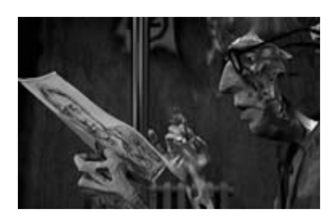
Figure 4 Still image from Landreth's psychorealistic Ryan (2005).

Of course, 3D CG is modular and object-oriented (both under the hood and in the animation process), making 3D metamorphosis, figureground reversals and some distortion effects difficult, even counterintuitive. Despite being digital, it lacks some of the flexible simplicity of pen and ink, and the 'dream of plasmatic freedom', signified for