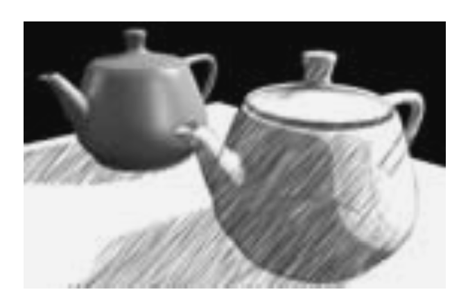
Figure 6 Expressive rendering – contrasting naturalistic and expressively rendered duplicate objects from a single 3D scene (using a Maya toon-style render).

If well handled, expressive rendering has the potential to meaningfully expand the palate of artistic effects and can open up expressive opportunities for animation artists. On the down side, many of the effects implemented using NPR have been trivial or gimmicky. There is a difference between images of expressive or artistic merit and ones that look vaguely artistic, and switching on a Van Gogh style filter will most likely generate kitsch. A paper titled 'A Real-Time "Boiling Style" Nonphotorealistic Rendering System for Low Fidelity Animation' describes an NPR system that 'produces jittery style drawings' that mimic 'low-fidelity animation conventions to produce rendered models that look hand drawn rather than machine interpreted' (Hesselgren and Naftel, 2003). Without denigrating the system in question, the description does beg the question as to whether algorithms that automate 'jittery style drawings' that 'look hand drawn' can help output genuinely expressive animation. Animation