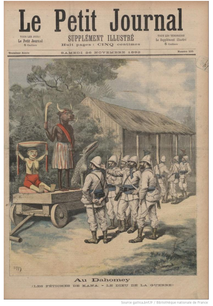
Figure 2 Front cover of Le Petit Journal, Supplément illustré, 26 November 1892.

statue a standing figure holding up a sword and with a bull's head (the 'buffalo').<sup>26</sup> At the left in the background of the image the animal heads of further sculpted figures flanking the pillars of a building can be seen. The French soldiers adopt relaxed poses as they stand back and contemplate the sculptures, one gesturing towards them while another smokes a cigarette, hands behind his back.