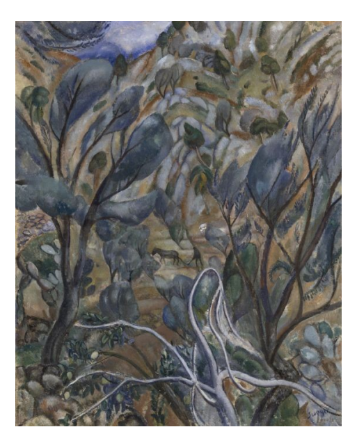
5 Joaquim Sunyer, Paisatge de Mallorca (Majorcan Landscape), 1916, oil on canvas, 125.5 x 100.5 cm. Museu Nacional d'Art de Catalunya, Barcelona

Rusiñol following sojourns in Paris.<sup>24</sup> Pictorial enquiry was equally pursued by Isidre Nonell, traditionally presented as a second-generation modernista , and by Pablo Picasso, who at the close of the century was working in Barcelona in close contact with the modernista circle.<sup>25</sup> It can also be seen in the work of noucentista artists such as Joaquim Sunyer (fig. 5) who is often cited as this movement's most noted representative.<sup>26</sup> And it took its most radically antiacademic form in the work of avant-garde artists such as Rafael Barradas and his vibrationist paintings.