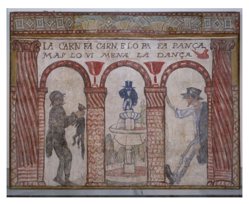
11 Xavier Nogués, fragment of mural paintings originally at the Galeries Laietanes cellar, 1915, tempera on plaster, 209 x 272 cm. Museu Nacional d'Art de Catalunya, Barcelona

[46] In one of the cellar's largest panels (fig. 11), one such character is used as the decorative sculpture topping a fountain that sprouts wine instead of water. In an outraged hand-on-hip posture (also visible in the bourgeois character in fig. 10) and with his hat resting directly on his nose, he watches from his high position as a man strangles a cat while another struggles to stand upright under the effects of drink. Above, an inscription offers a popular saying: "meat makes flesh, and bread makes belly, but wine leads to dancing".