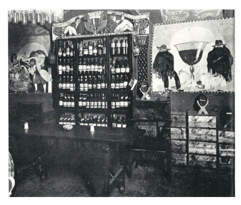
2 Xavier Nogués, partial view of the mural paintings at the Galeries Laietanes cellar, Barcelona, 1915. ( Xavier Nogués: Pintures murals procedents del celler de Les Galeries Laietanes, exh. cat., Barcelona 1984, 16)