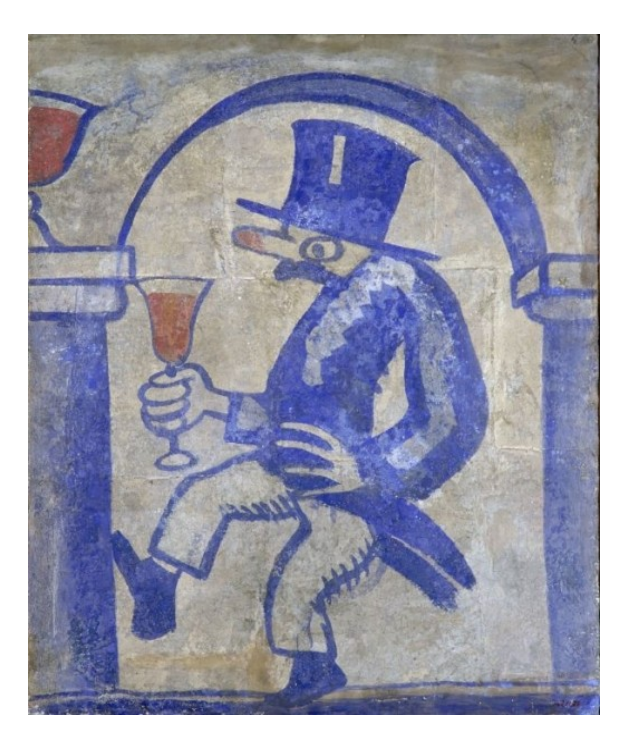
4 Xavier Nogués, fragment of wall decoration, originally at Galeries Laietanes, 1915, tempera on plaster, 83 x 70 cm. Museu Nacional d'Art de Catalunya, Barcelona

[2] The basement's decoration had been commissioned by the gallery owner to Xavier Nogués (1873-1941), an artist in the noucentista circle. Renowned for his engraving and caricature work, Nogués devised a composition that required taking the language of cartoons out of its traditional printed medium and applying it in full colour and large dimensions on plaster. His innovative display of mural caricature was very well-received and earned Nogués the recognition of his peers. However, this artist's concerns never travelled the route of formal and