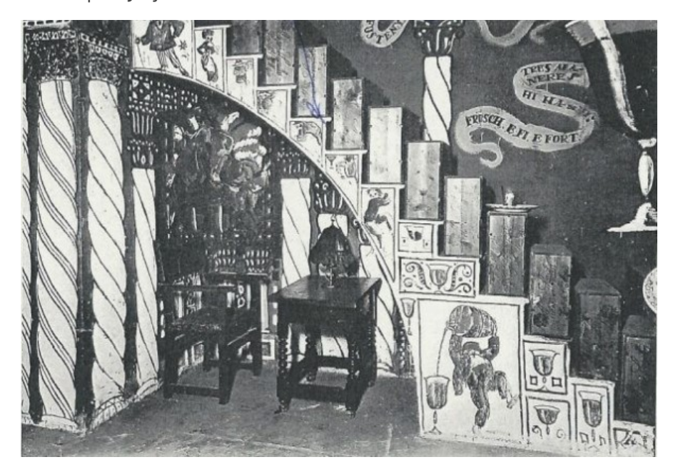
3 Xavier Nogués, partial view of the mural paintings at the Galeries Laietanes cellar, Barcelona, 1915. ( Xavier Nogués: Pintures murals procedents del celler de Les Galeries Laietanes, exh. cat., Barcelona 1984, 9)