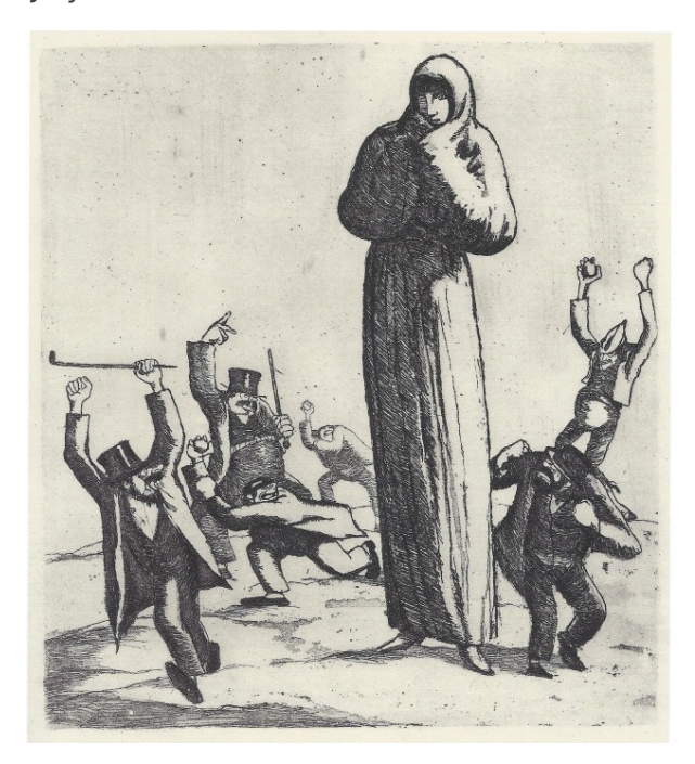
13 Xavier Nogués, cover illustration for Eugeni d'Ors' La ben plantada , 1911, etching and aquatint

[49] Four years later, Nogués chose the same combination of characters – La ben plantada surrounded by cartoon-like male figures – to cover the walls of a venue for the discussion of contemporary art and culture. His decision to recreate at Galeries Laietanes the characters he had first depicted on the cover of the noucentista "bible" suggests that his design for the gallery's basement was more than a random assortment of carefree drinkers thematically suited to the intended relaxed atmosphere of the place; the cartoon composition appears to contain, in fact, a clear reference to the movement itself.