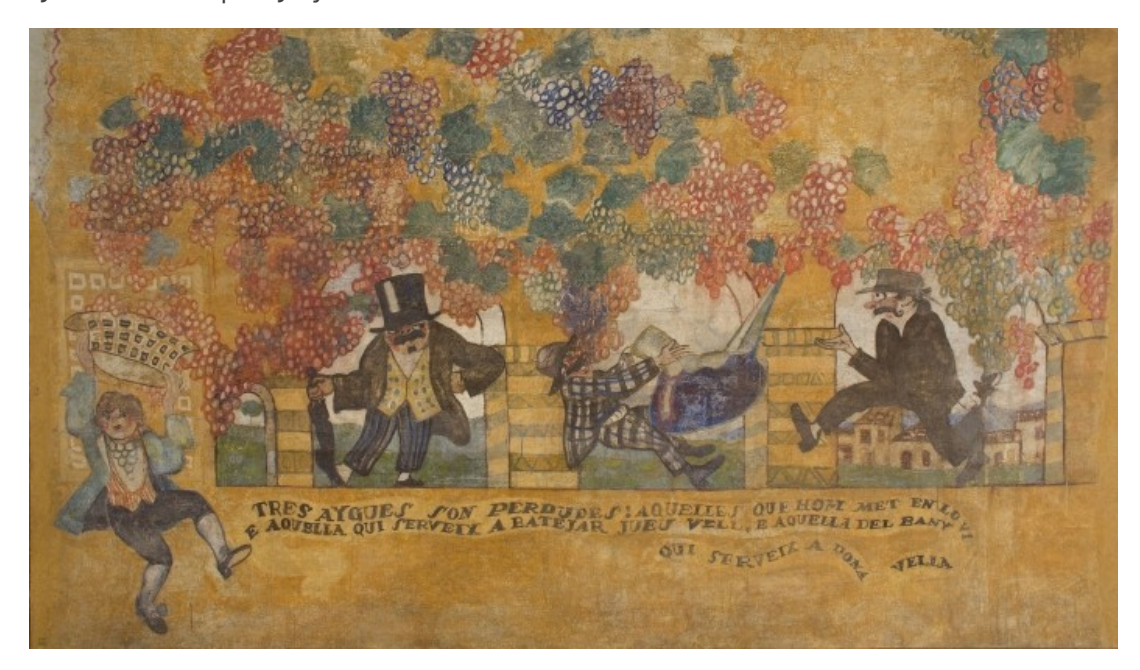
10 Xavier Nogués, fragment of mural paintings, originally at the Galeries Laietanes cellar, 1915, tempera on plaster, 210 x 365 cm. Museu Nacional d'Art de Catalunya, Barcelona

[46] In one of the cellar's largest panels (fig. 11), one such character is used as the decorative sculpture topping a fountain that sprouts wine instead of water. In an outraged hand-on-hip posture (also visible in the bourgeois character in fig. 10) and with his hat resting directly on his nose, he watches from his high position as a man strangles a cat while another struggles to stand upright under the effects of drink. Above, an inscription offers a popular saying: "meat makes flesh, and bread makes belly, but wine leads to dancing".