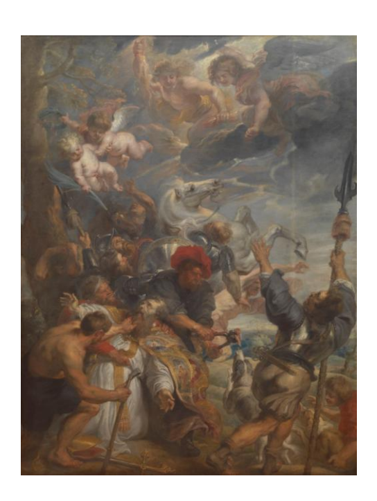
Figure 3 Peter Paul Rubens, Martyrdom of St. Livinus , 1633. Oil on canvas, 455 x 347 cm.

Fromentin communicates with the reader in the second person – ( you ) 'forget' – telling her or him to momentarily set aside the iconography of the work in favor of the formal aspect of its color, a rhetorical move Greenberg would have appreciated.