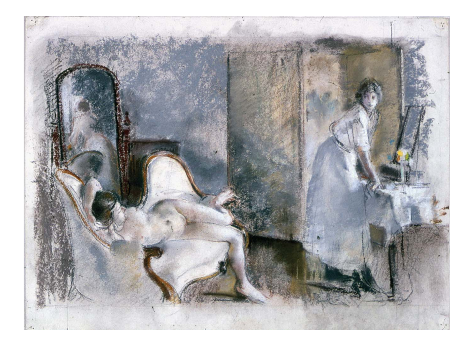
Figure 7. Henry Tonks, The Toilet , exhibited 1914, pastel, 33 × 44.1 cm. Tate Collection, London.