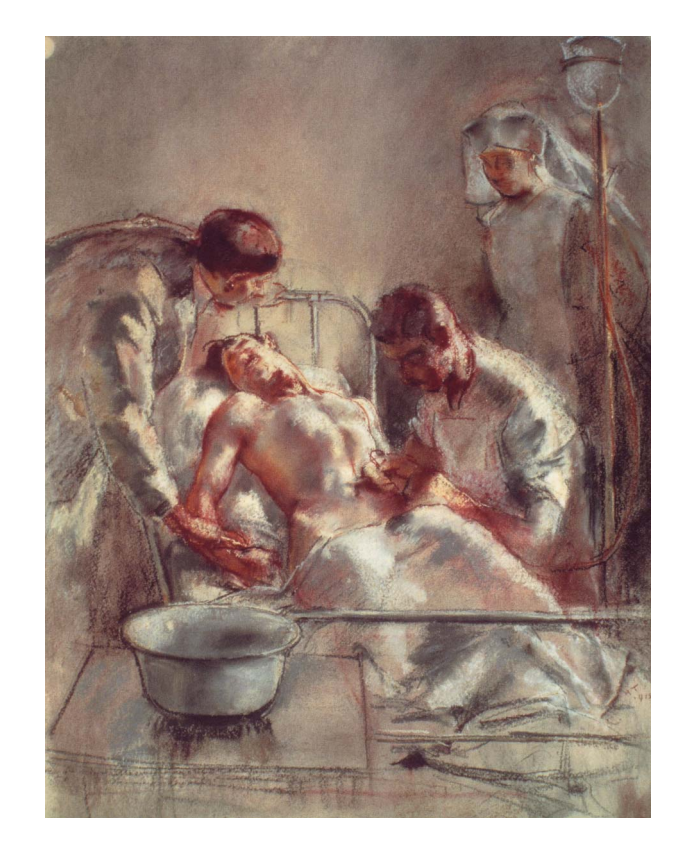
Figure 8. Henry Tonks, Saline Infusion: An Incident in the British Red Cross Hospital Arc en-Barrois , 1915, pastel, 67.9 × 52 cm.