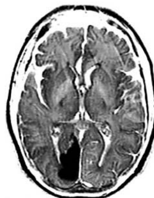
Figure 2 Patient 1’s occipital stroke, as shown in an MRI 3 weeks after the acute event. Fast spin echo T2 (TR: 3800 ms, TE: 90 ms, NEX: 2, FOV: 173×230, matrix: 190×256, 30% gap) 5 mm thick transverse section.

He started drawing and painting 1 month after the stroke and, after a few weeks, comments by relatives and clients made him aware that some changes had occurred in his art. Human limbs and hands were thinner, sharper, and more stylised (fig 1B) and the details simplified. Compared to his