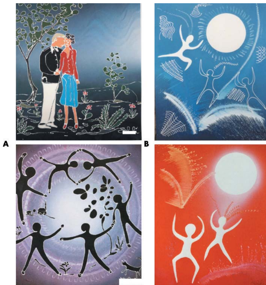
Figure 1 Paintings by patient 1 some months before (A) and 4 months after (B) stroke. The scenes were chosen because of their similarity to highlight the small stylistic changes.