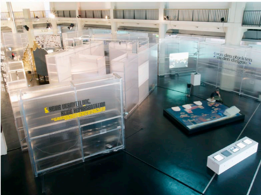
Figures 4 and 5 View of the exhibition ‘Making Things Public’, March 20–October 3, 2005, ZKM | Center for Art and Media Karlsruhe, © ZKM | Center for Art and Media Karlsruhe, photo: Franz Wamhof.

experimented by creating a performance of democracy through art (see Figures 4 and 5). Divided into 13 subject areas, including ‘the parliaments of nature’ which dealt with the politics of ecology, ‘no mediation, no