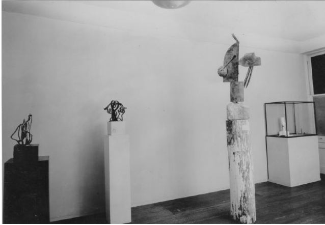
Figure 2 Installation view of the exhibition ‘Cubism and Abstract Art’. New York, MoMA, 2 March to 19 April 1936. Cat. no.: IN46.8B.

out different ways of conveying the emotional charge of an image, the stylization of Wilhelm Lehmbruck’s sculpture, Standing Youth (1913), was shown alongside a Romanesque crucifix, Georges Rouault’s painting of Christ Mocked by Soldiers (1932) and Ryman Bloom’s The Synagogue (Figure 3). The exhibition design further emphasized the theoretical hypothesis of an encompassing notion of modern art across historical periods through the creation of spacious and darkened galleries where the works were spotlighted as if suspended in time.