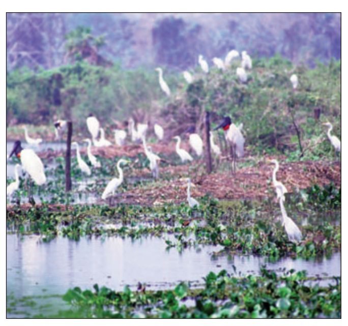
Figure 5: A marsh alongside the Paraguay River with egrets, spoonbills, ibises and Maribu storks all resting quietly. Our host's pistol shot raised a veritable cloud of marsh birds.