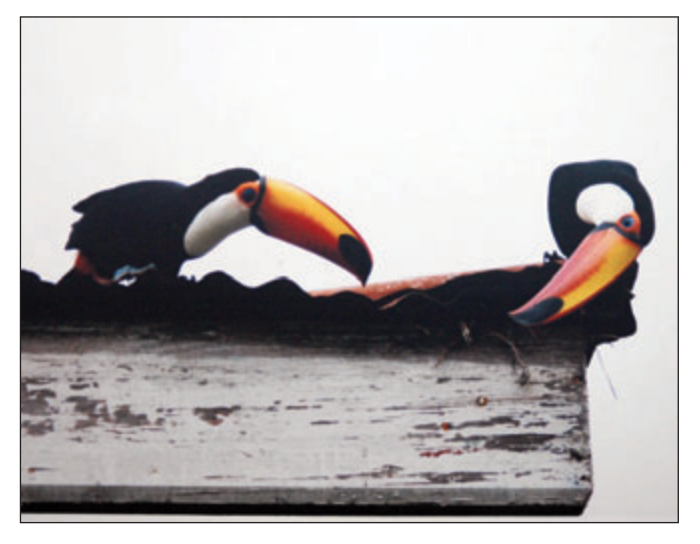
Figure 1: Two chestnut-mandible toucans picking insects under the shingles of an old shed at Iquitos, Peru.

With a 50 horse-power US built outboard attached to a big dug-out canoe, our guide took us down river to two ports of call. The first was a pre-arranged rendezvous with several male members of a jungle tribe each wearing straw skirts and each carrying a blow-gun. They demonstrated their ability to use their implements to kill parrots in a flock near the top of a forest giant. This contrived visit to a primitive tribe was rewarded by Schmitt