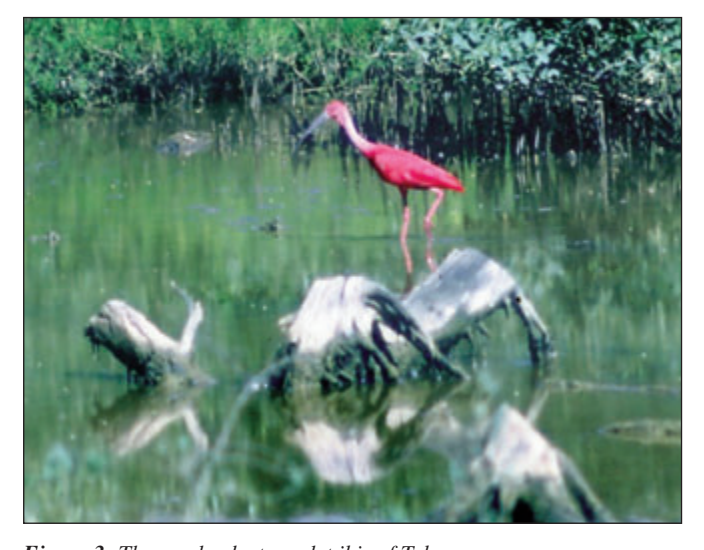
\textbf{\it Figure 3:}\ The\ resplendent\ scarlet\ ib is\ of\ Tobago.

As part of our "Green-Hell" tour from Manaus we were taken in a dugout up a nearby tributary (the Negro River) to a small lake. The main features were many cayman (freshwater crocodiles) and abundant water-lilies (Victoria lily) with leaves of an average of four feet in diameter (unique in the world for size, not a few reaching six feet in diameter.) They bore easily the weight of a pair of northern jacanas with their three young. (Jacanas are close relatives of our marsh rails but with exceptionally long toes). We fished for piranhas. When hooked