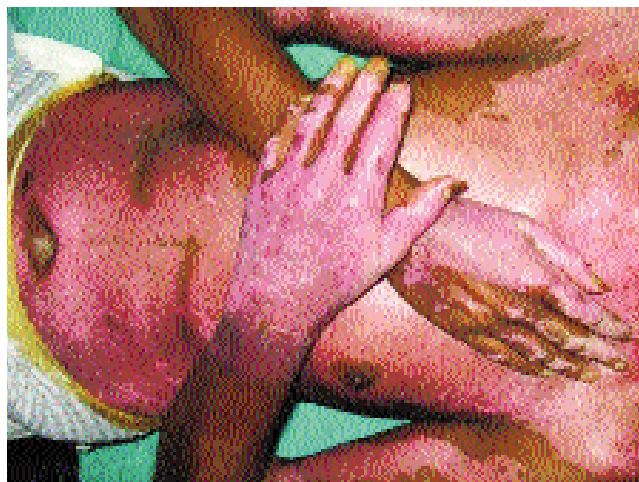
Figure-2: A male patient 42 year of age had a flame burn treated with Aloe Vera Dressing. Wound showing epithelisation at the time of discharge at 14th day post burn.

Figure-1 and 2 show the results of aloe vera dressing.