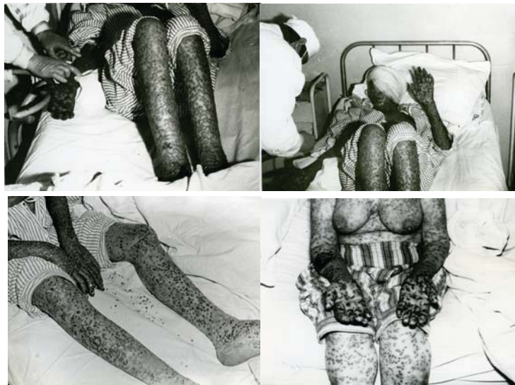
Fig. 3 – Smallpox – hemorrhagic form