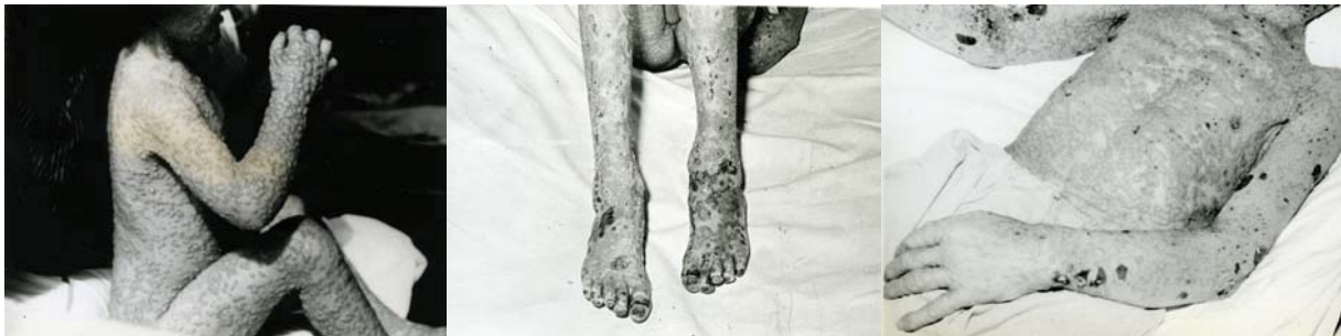
Fig. 4 – Smallpox – scab stage

Quarantine measures were applied for suppression of the epidemic, but the Federal Epidemiological Committee made a decision to perform vaccination of the complete population of Yugoslavia – 18 million people. These measures gave results and the epidemic ended already in April.