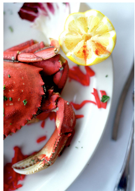
San Francisco is known for its fine dining and diverse culture.

Each year, on the Wednesday prior to the start of the Annual Meeting, APSA hosts half- and full-day short courses that provide opportunities for meeting attendees to enhance knowledge and reinvigorate teaching or research skills. Short courses are only open to registered Annual Meeting attendees and preregistration is required. View details on the Annual Meeting website's short course page: http://web.apsanet.org/apsa2017/short-courses/ . ■