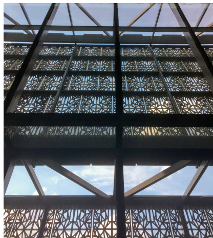
Figure 2. An interior view of the exterior panels at the National Museum of African American History and Culture, June 2017.