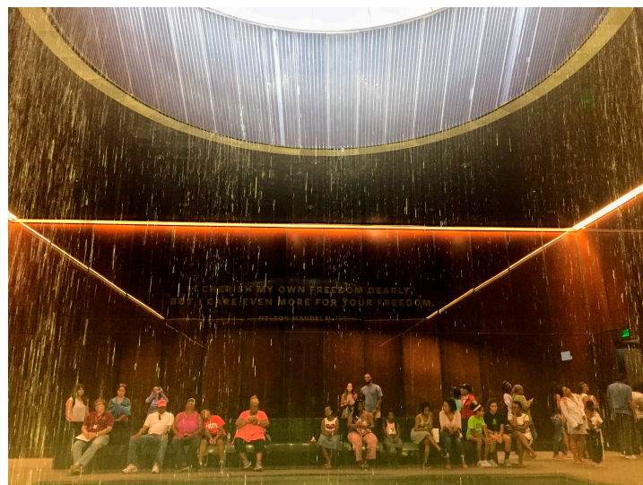
Figure 4. The interior contemplative court of the National Museum of African American History and Culture, June 2017.

Barbara Holmes, who has examined contemplative practices of the black church, notes that for African and African American people, contemplation can take individual or communal forms. Communal practices of contemplation, she explains, are about orienting the gathered community and unifying them with a shared vision of the work of the Divine. She writes, “Contemplation in Africana contexts is an act of communal reflection and reflexive engagement with both knowable and unknowable occurrences. In communal settings, it is the confluence of atomistic experiences and reflection grounded in a shared interpretive process” (Holmes 2004, p. 46). This element of spirit in contemplation and in the NMAAHC contemplation court’s design is ultimately oriented to the shared