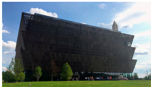
Figure 1. An exterior view of the National Museum of African American History and Culture with the Washington Monument in the background, June 2017.