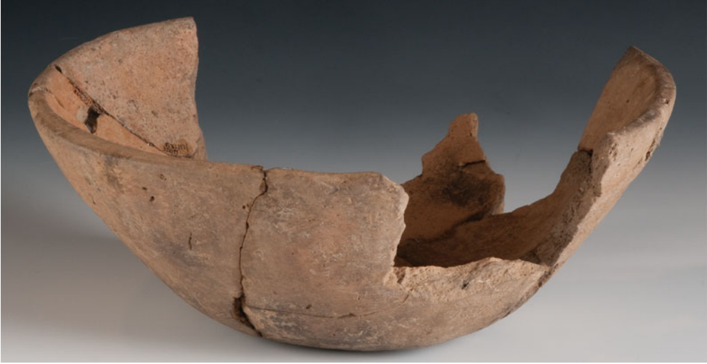
Figure 1. A colonoware bowl from the South Grove Midden excavations at Mount Vernon. The bowl (rim diameter 160mm) dates to Phase 1 (c. 1735–1758) and therefore probably relates to the household of Lawrence Washington, who passed the estate via his widow to his younger half-brother, George.