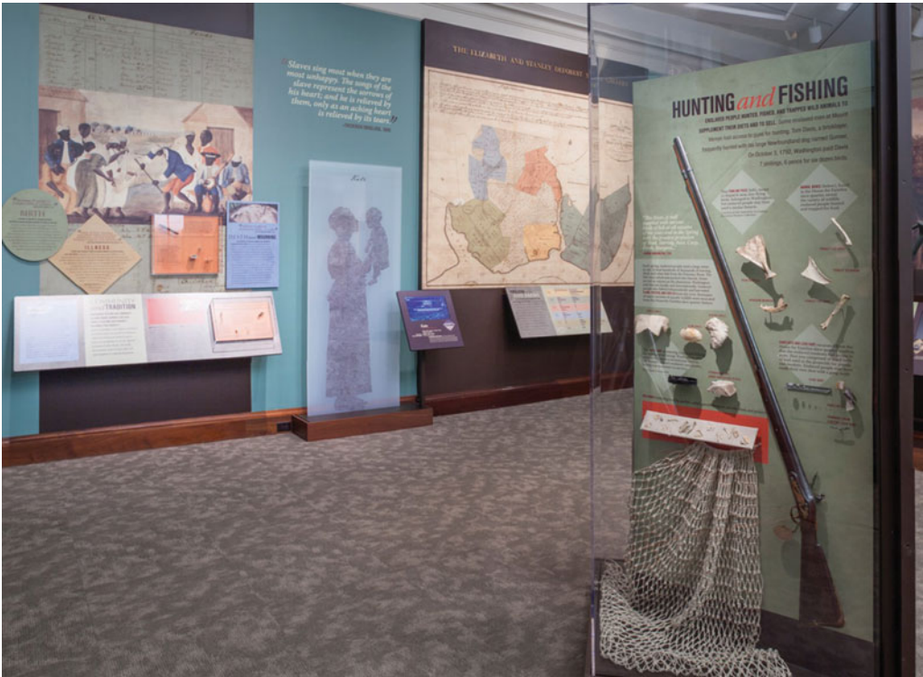
Figure 2. The 'Lives Bound Together: Slavery at George Washington's Mount Vernon' exhibition.

title of the 'American Cincinnatus'. Fittingly, therefore, when he was laid to rest at Mount Vernon, first in the family vault and then in a bespoke tomb, these modest structures were less than regal. In contrast, two of the papers in this issue of Antiquity deal with more extravagant tomb sites. The first of these, by Hassett and Sağlantimur, takes us to Mesopotamia and a large cist burial at the third-millennium BC site of Başur Höyük. Here, analysis of grave goods and human bone suggests a retainer burial, which the authors argue reflects a wider trend for human sacrifice during the unstable periods associated with the emergence of stratified—possibly royal—societies. The second paper, by Mizoguchi and Uchida, moves to China and the site of YinXu. Drawing on the 1930s excavations of the royal Shang cemetery of Xibeigang ( Hsi-Pei-Kang ), the authors present a new chronological sequence—linking each tomb to a king named in the ancient sources—and explore how the location and orientation of the tombs physically and symbolically positioned both the deceased and the living in relation to the ancestors.