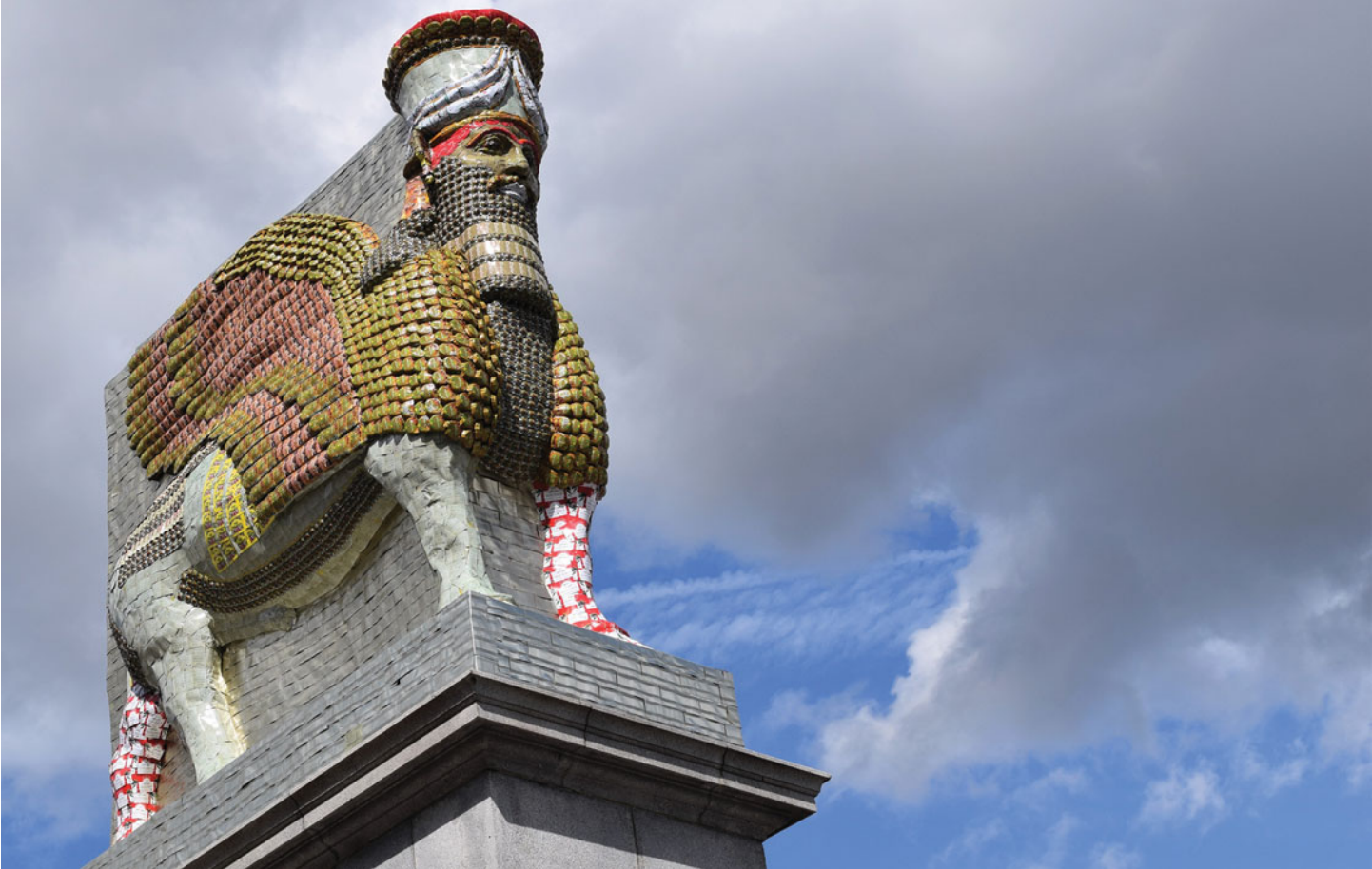
Frontispiece 2. The latest commission for the Fourth Plinth in Trafalgar Square, 'The Invisible Enemy Should not Exist' by Michael Rakowitz, was unveiled on 28 March 2018. Fashioned from Iraqi date-syrup tins, it represents the Lamassu that guarded the Nergal Gate at Nineveh from c. 700 BC until its destruction in 2015 by ISIS. In 2016, Trafalgar Square hosted a reconstruction of another monument destroyed by so-called Islamic State, Palmyra's Triumphal Arch. The latter has subsequently visited New York, Dubai, Florence and the Archaeology Museum in Arona, Italy.