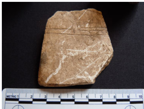
Figure 2. The Wharram Grange Crossroads figurine fragment: dorsal face.

that personhood was ‘not limited to the boundaries of the epidermis’ (p. 126), but could also be constituted through body art, hair styling, clothing, even the use of incense or oils, alongside actual arms, as part of costumes that ‘visually and acoustically accentuated the body’ (p. 127). Qualities of youth, physical power, sexual potency, and courage are illustrated through the ‘blaze’ of light said to surround heroes such as Achilles: a sheen that Treherne discusses in relation to the fleshy-material amalgam of shields, breastplates, blades, hair, muscles, sweat, used in such synergy with the warrior’s body that they became not just trappings but extensions of the self. Treherne draws archaeologists away from the field of violence itself into the most intimate rituals of self-care that protected and strengthened these figures, as well as the rites that dealt with their injuries; prepared and buried their corpses in a fitting send-off, and—their direct corollary—despoiled, stripped, and defamed the bodies of enemies. And finally, he points to the after-work of commemoration: the graveside performances and monuments (warrior ‘stelae’ or tumuli, figurines or motifs) as corollaries of Greek epic poetry, which fixed them in both the land and the memory of their brothers-in-arms and descendants. Seminal to all of