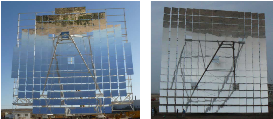
Fig. 2. Mirror pattern (a) Prototype; (b) Orion dish.

The mirror pattern in the prototype dish, approximating a circular area, is the optically most efficient one. However, the required effort for the supporting steel structure is less than optimum since the edges of the structure are not equipped with mirrors. A techno-economic analysis showed that a square mirror pattern, with reduced overall size (24 x 24.5 m instead of 26.5 x 25 m) - and optically less efficient edge mirrors - saves considerably more steel and thus cost than the equivalent of the slightly reduced overall performance makes up.