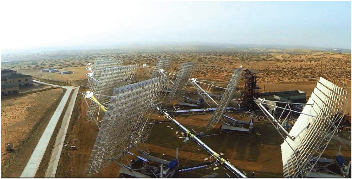
Fig. 4. Orion plant near Wuhai, Inner Mongolia.