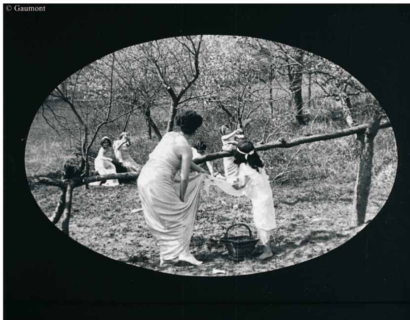
Figure 8. L'Éventail animé (Émile Cohl, F 1909).