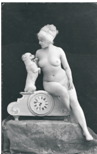
Figure 2. Full page advertisement for the tableaux vivants group 3 Olympier in Das Programm no. 182 (1905)