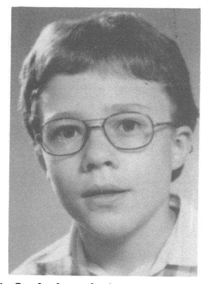
Figure 6 Case 3 at 9 years showing normal hair.

Examination of the hair was unremarkable under