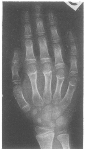
Figure 8 Case 3 at 9 years showing shortness of hand bones with metaphyseal irregularities.

Figure 7 Case 3 at 9 years showing metaphyseal irregularities of the knee.