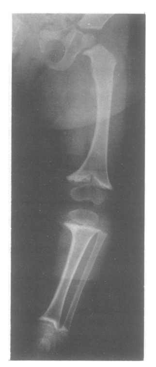
Figure 4 Case 2 at 15 months. Lower metaphysis of the femur and tibial metaphyses are enlarged and very irregular.