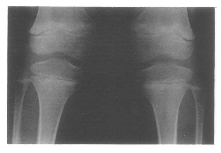
Figure 7 Case 3 at 9 years showing metaphyseal irregularities of the knee.