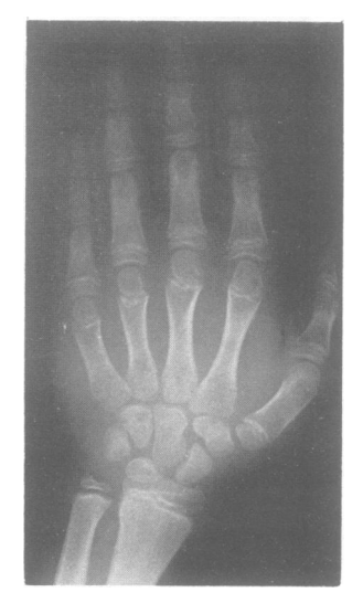
Figure 3 Case 1 at 8^{1/2} years showing slight metaphyseal irregularities and shortened bones.

Skull and spine radiographs were strictly normal.