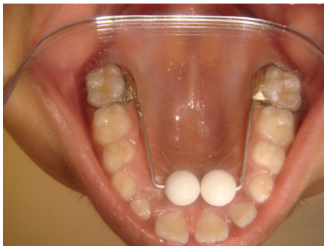
FIGURE 3: Modified blue grass appliance.

therapy to cease the habit [19]. Haskell and Mink described that blue grass appliance which is easy to wear, and did not have problems associated with traditional palatal cribs. The design consisted of hexagonal Teflon roller on a cross-palatal wire which was effective to ending the sucking habit in several days [14].